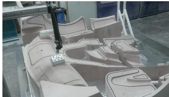
Image shows a Concept Tooling machining fixture for super-car Carbon-fibre rear dam shell. Concept also manufacture high precision checking gauges for verification and quality control, plus supplying touch and non-touch surface data capture for full dimensional reporting.